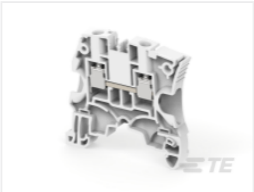
TE Part #1SNK506010R0000 ZS6