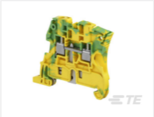
TE Part #1SNK505150R0000 ZS4-PE