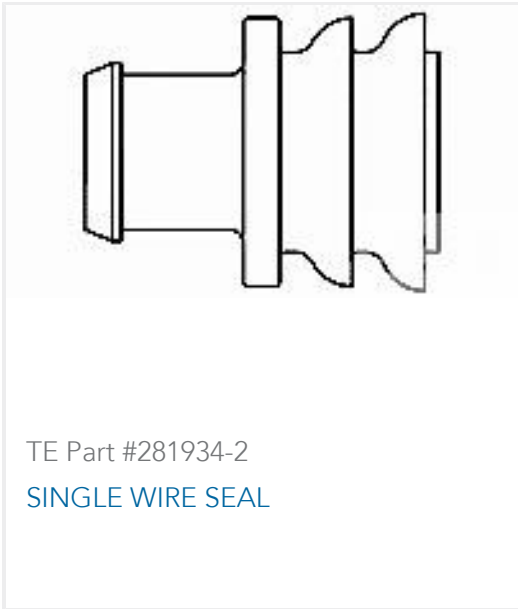
TE Part #281934-2 SINGLE WIRE SEAL