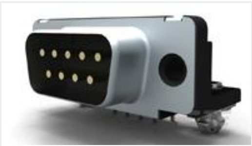
TE Part #5747840-3 HD-20 PLUG RA .318 FMS BD-LK 4