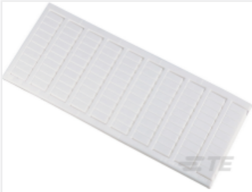
TE Part #1SNK140022R0000 MC512PA 11->20 (x10) Vertical