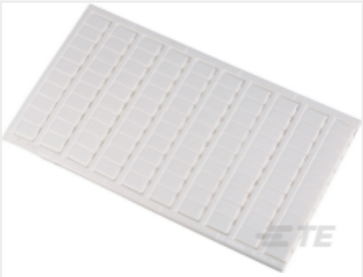
TE Part #1SNK160032R0000 MC812PA 21->30 (x10) Vertical