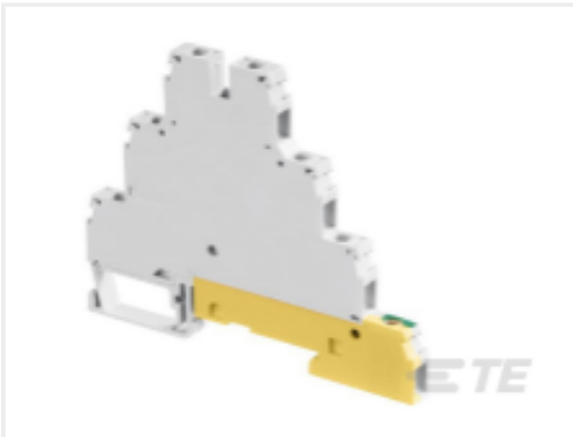
TE Part #1SNA299684R0200 D4/6.T3.P