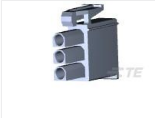
TE Part #172166-1 3 CIR UNIV M-N-L PLUG

ENG_CVM_CVM_1SNK160091R0000_A.2d_dxf.zip