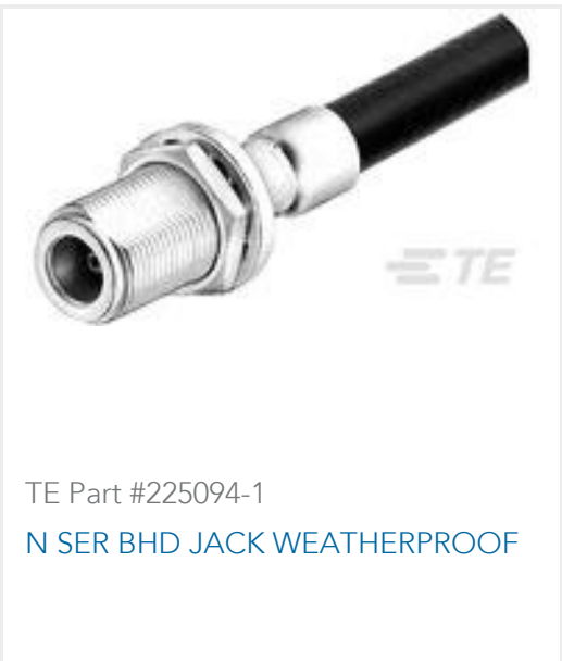
TE Part #225094-1 N SER BHD JACK WEATHERPROOF