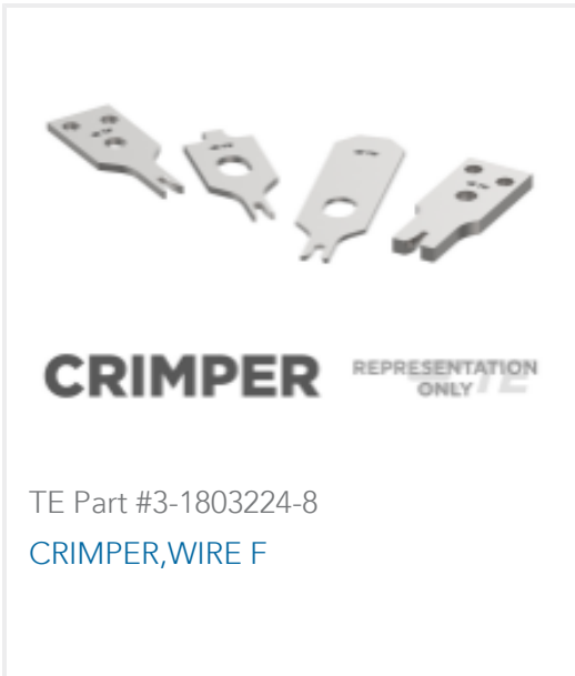
TE Part #3-1803224-8 CRIMPER, WIRE F