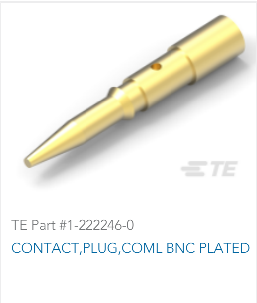
TE Part #1-222246-0 CONTACT,PLUG,COML BNC PLATED