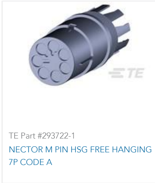
TE Part #293722-1 NECTOR M PIN HSG FREE HANGING 7P CODE A