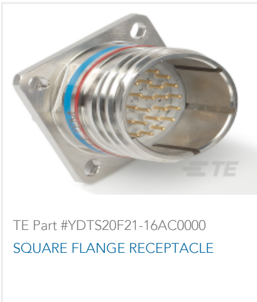
TE Part #YDTS20F21-16AC0000 SQUARE FLANGE RECEPTACLE