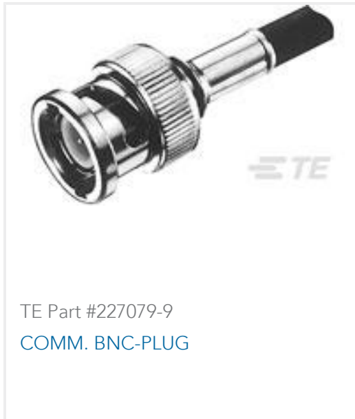
TE Part #227079-9 COMM. BNC-PLUG