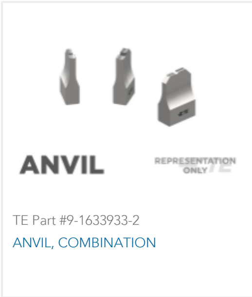
TE Part #9-1633933-2 ANVIL, COMBINATION