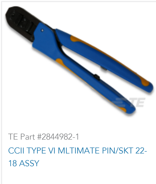
TE Part #2844982-1 CCII TYPE VI MLTIMATE PIN/SKT 22-18 ASSY