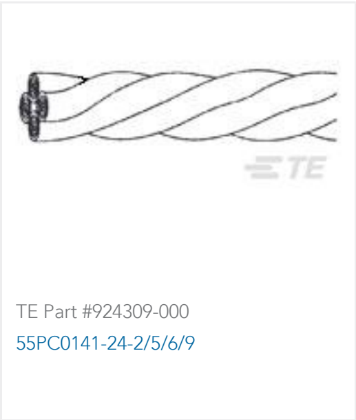
TE Part #924309-000 55PC0141-24-2/5/6/9