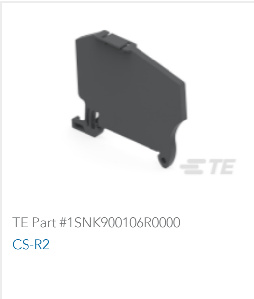
TE Part #1SNK900106R0000 CS-R2