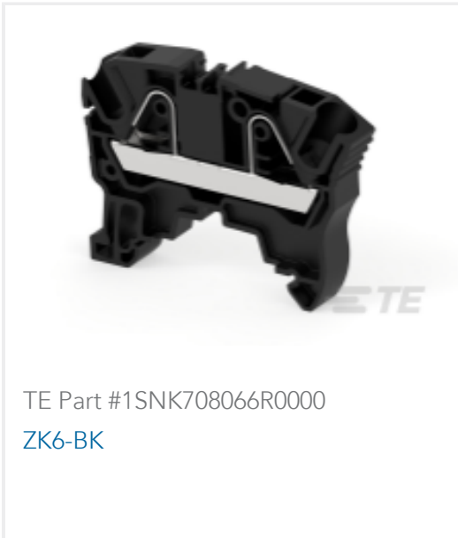
TE Part #1SNK708066R0000 ZK6-BK