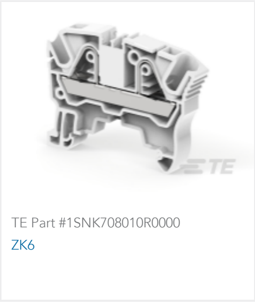
TE Part #1SNK708010R0000 ZK6