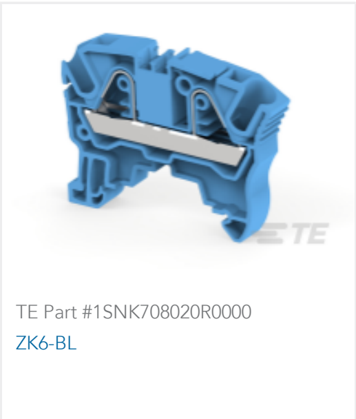
TE Part #1SNK708020R0000 ZK6-BL