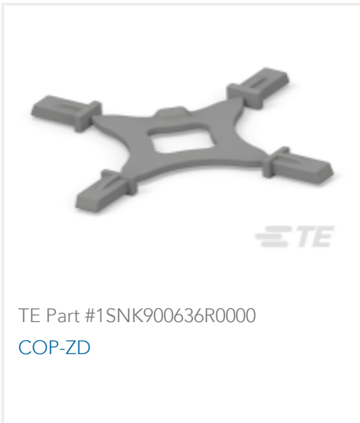
TE Part #1SNK900636R0000 COP-ZD

ENTRELEC Terminal Block - Master Catalog