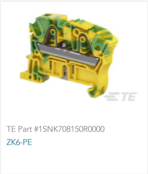
TE Part #1SNK708150R0000 ZK6-PE