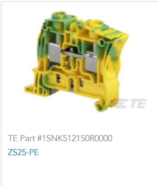
TE Part #1SNK512150R0000 ZS25-PE