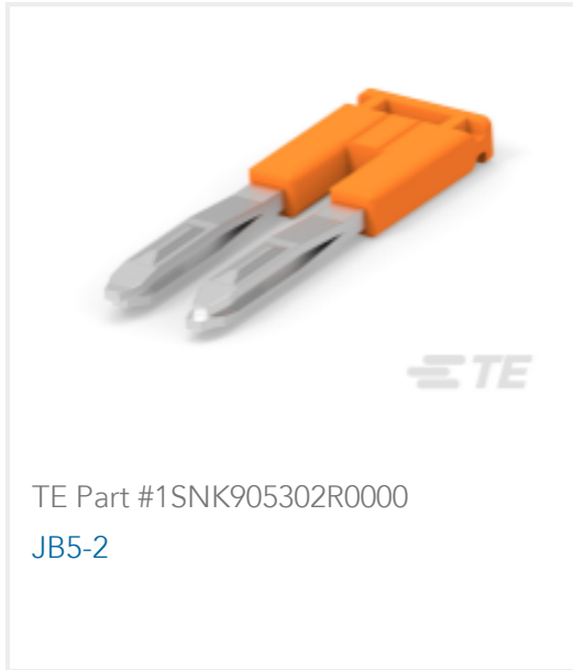
TE Part #1SNK905302R0000 JB5-2