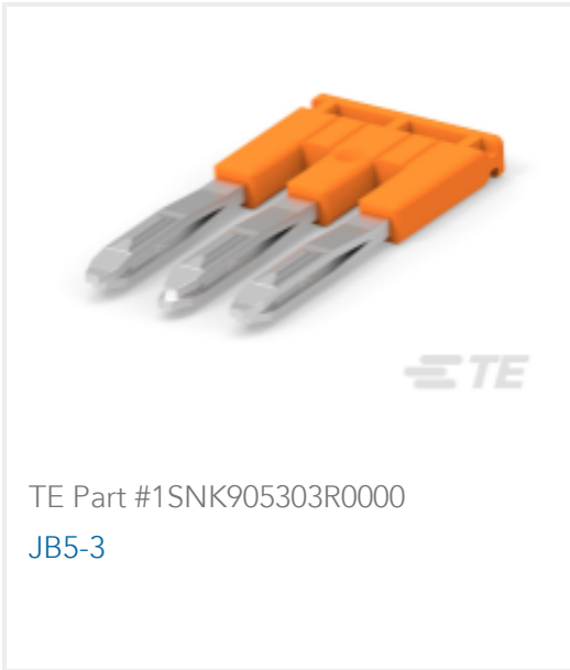
TE Part #1SNK905303R0000 JB5-3