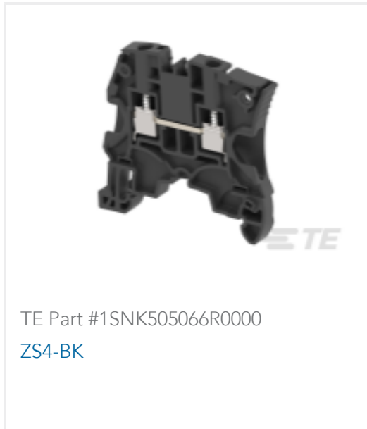
TE Part #1SNK505066R0000 ZS4-BK