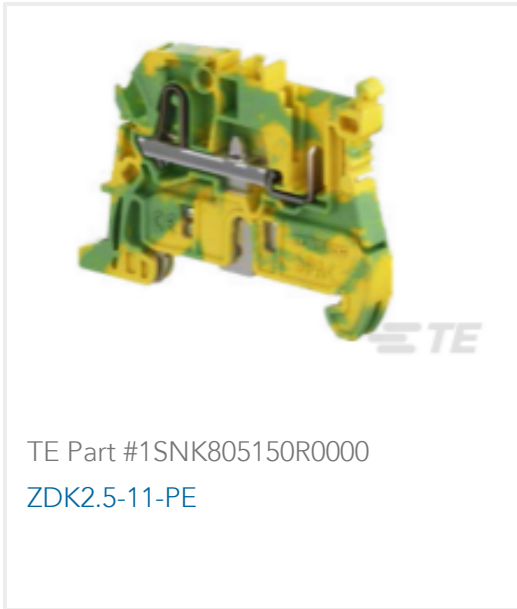
TE Part #1SNK805150R0000 ZDK2.5-11-PE