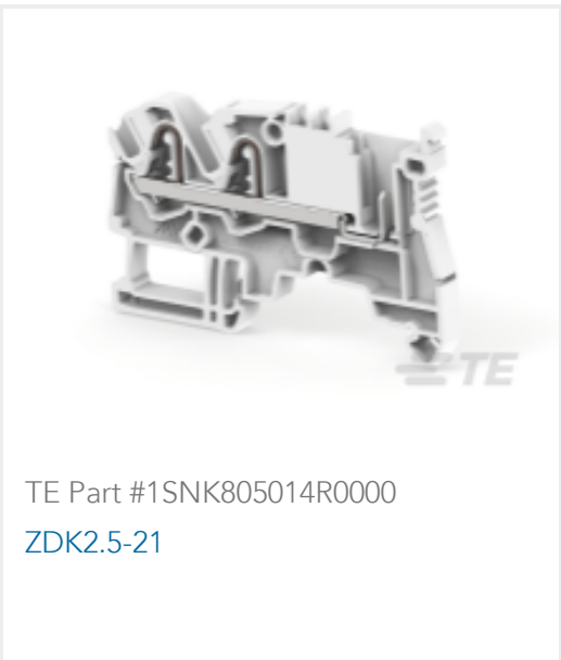
TE Part #1SNK805014R0000 ZDK2.5-21