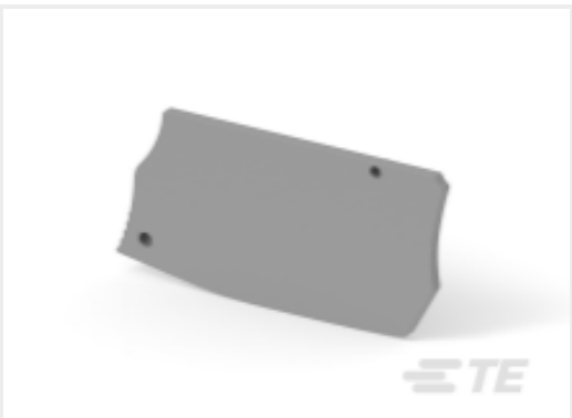
TE Part #1SNK505910R0000 ES4