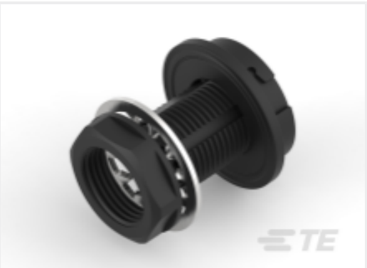
TE Part #2213858-1 RECEPTACLE ASSEM., LUMAWISE ENDURANCE S