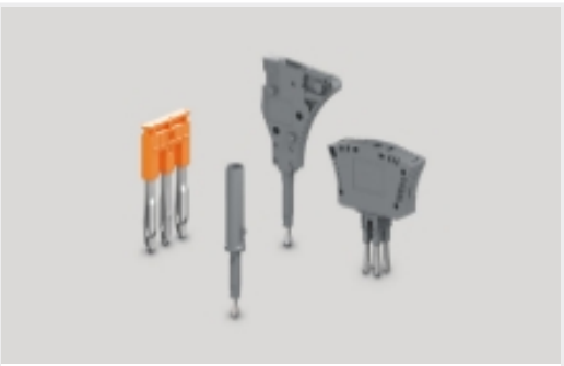
Terminal Block & Strip Conducting Accessories(67)