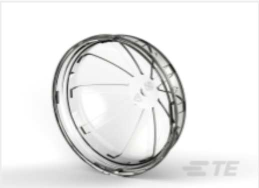
TE Part #1-2328823-1 LUMAWISE S 80MM DIA DOME CLEAR LOW