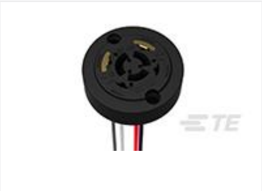
TE Part #2213362-2 Rcpt Assy,Dimmable Photocontrol, 150C,3/4