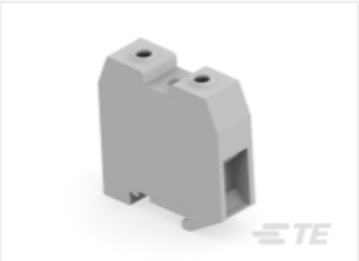
TE Part #1SNK522010R0000 ZS70