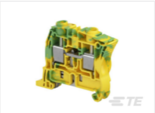
TE Part #1SNK510150R0000 ZS16-PE