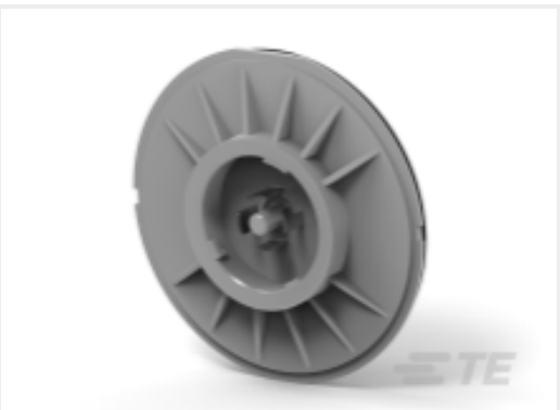
TE Part #2213831-3 BASE ASSY, 80MM, SEALED