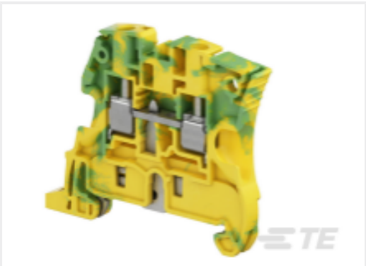
TE Part #1SNK506150R0000 ZS6-PE