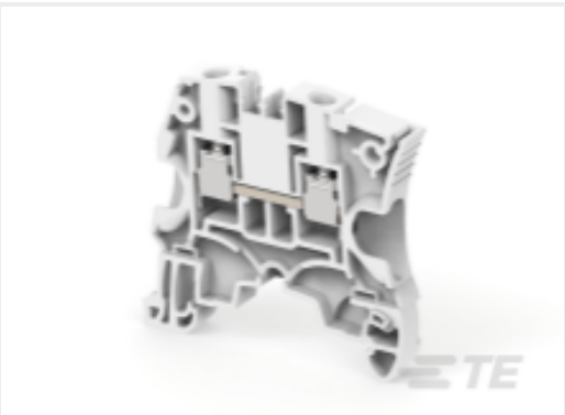
TE Part #1SNK506010R0000 ZS6