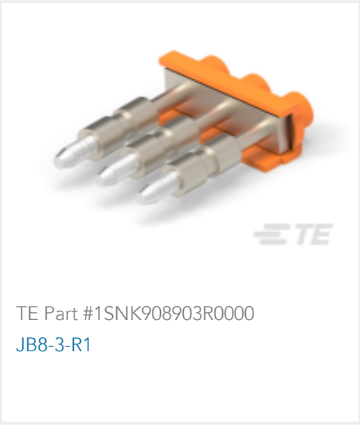
TE Part #1SNK908903R0000 JB8-3-R1