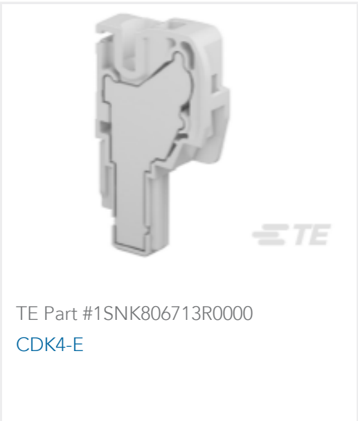
TE Part #1SNK806713R0000 CDK4-E