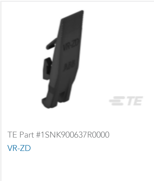
TE Part #1SNK900637R0000 VR-ZD