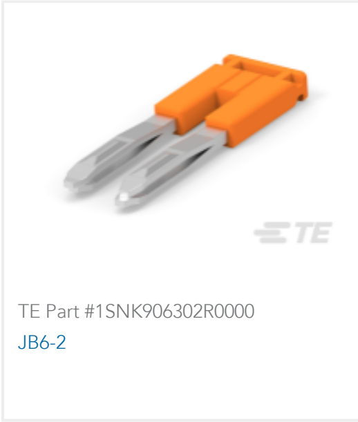
TE Part #1SNK906302R0000 JB6-2