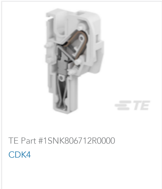
TE Part #1SNK806712R0000 CDK4