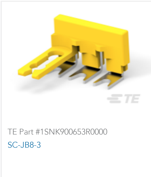
TE Part #1SNK900653R0000 SC-JB8-3