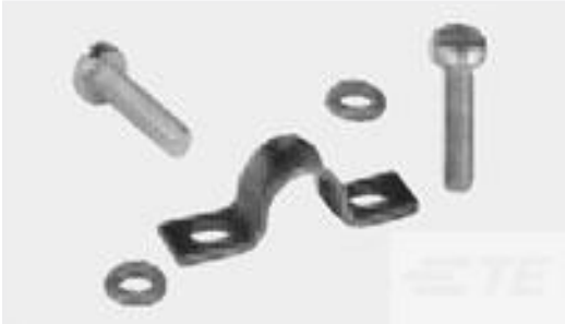
TE Part #2-1106302-9 SCHELLENSET 5MM