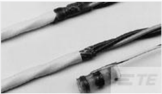
TE Part #796275-000 CWT-13