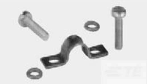
TE Part #1-1106302-9 SCHELLENSET 4,5MM