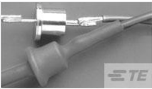
TE Part #5677614009 RNF-3000-39/13-0-SP