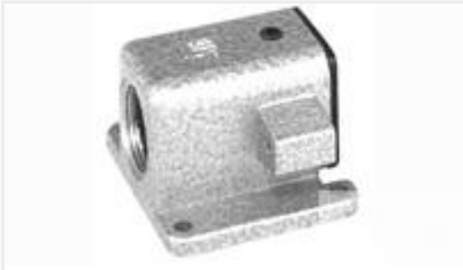
TE Part #1106401-2 EMV-K.3/4.SG.1.M16.G