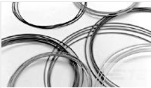
TE Part #2860873001 VG-95218-T021-E005