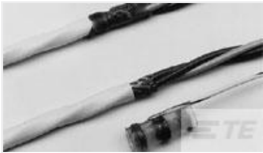
TE Part #775210-000 S01-03-R