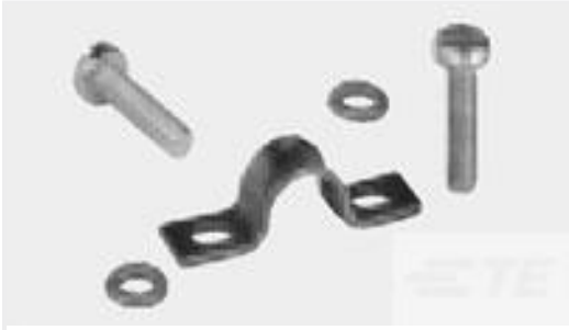
TE Part #4-1106302-9 SCHELLENSET 7MM