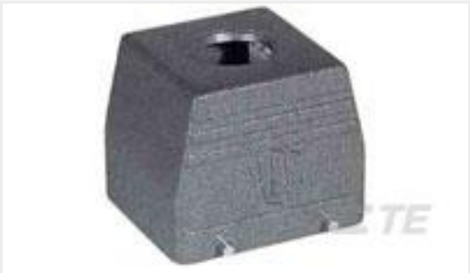
TE Part #1108719-1 EMV-K.6/16.STO1.13G