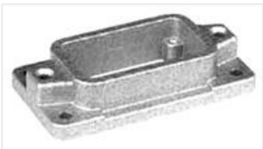
TE Part #2-1102606-5 HIP-K.6/16.AG.M6

This information is provided based on reasonable inquiry of our suppliers and represents our current actual knowledge based on the information they provided. This information is subject to change. The part numbers that TE has identified as EU RoHS compliant have a maximum concentration of 0.1% by weight in homogenous materials for lead, hexavalent chromium, mercury, PBB, PBDE, DBP, BBP, DEHP, DIBP, and 0.01% for cadmium, or qualify for an exemption to these limits as defined in the Annexes of Directive 2011/65/EU (RoHS2). Finished electrical and electronic equipment products will be CE marked as required by Directive 2011/65/EU. Components may not be CE marked. Additionally, the part numbers that TE has identified as EU ELV compliant have a maximum concentration of 0.1% by weight in homogenous materials for lead, hexavalent chromium, and mercury, and 0.01% for cadmium, or qualify for an exemption to these limits as defined in the Annexes of Directive 2000/53/EC (ELV). Regarding the REACH Regulation, the information TE provides on SVHC in articles for this part number is based on the latest European Chemicals Agency (ECHA) ‘Guidance on requirements for substances in articles’ posted at this URL: https://echa.europa.eu/guidance-documents/guidance-on-reach