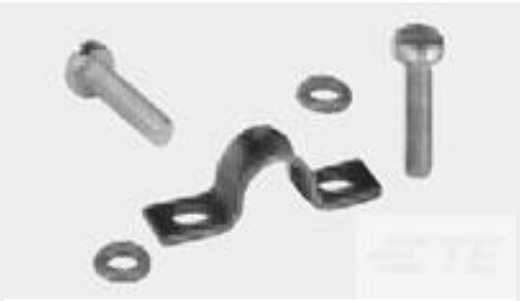
TE Part #5-1106302-9 SCHELLENSET 8MM