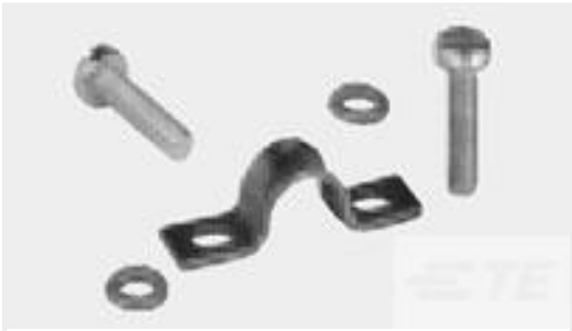
TE Part #4-1106302-9 SCHELLENSET 7MM