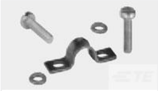
TE Part #1-1106302-9 SCHELLENSET 4,5MM