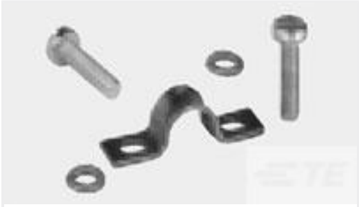
TE Part #2-1106302-9 SCHELLENSET 5MM