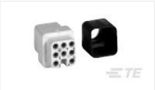
TE Part #2-1103105-3 HN.D.8.BU.C