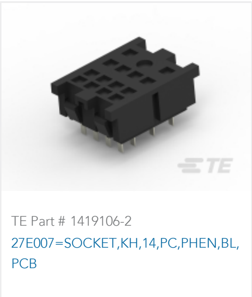
TE Part # 1419106-2 27E007=SOCKET,KH,14,PC,PHEN,BL, PCB