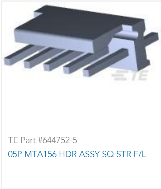
TE Part #644752-5 05P MTA156 HDR ASSY SQ STR F/L