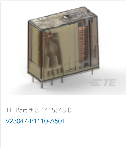
TE Part # 8-1415543-0 V23047-P1110-A501