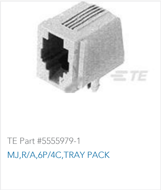
TE Part #5555979-1 MJ,R/A,6P/4C,TRAY PACK