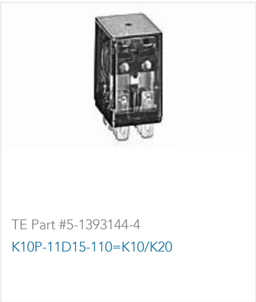
TE Part #5-1393144-4 K10P-11D15-110=K10/K20