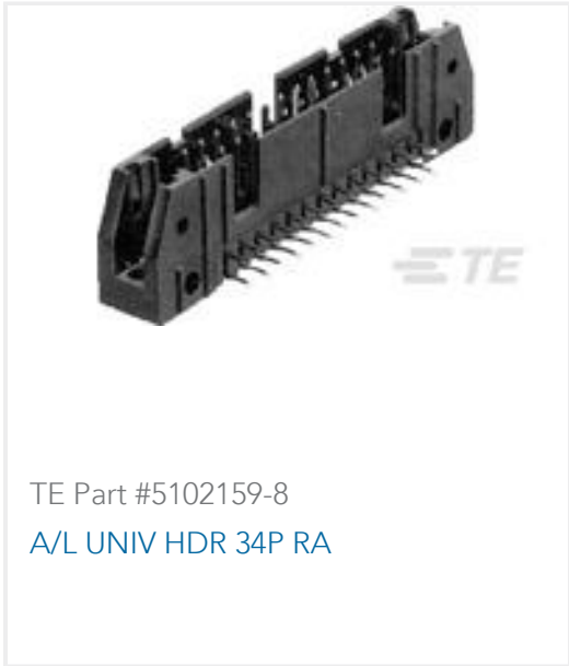
TE Part #5102159-8 A/L UNIV HDR 34P RA