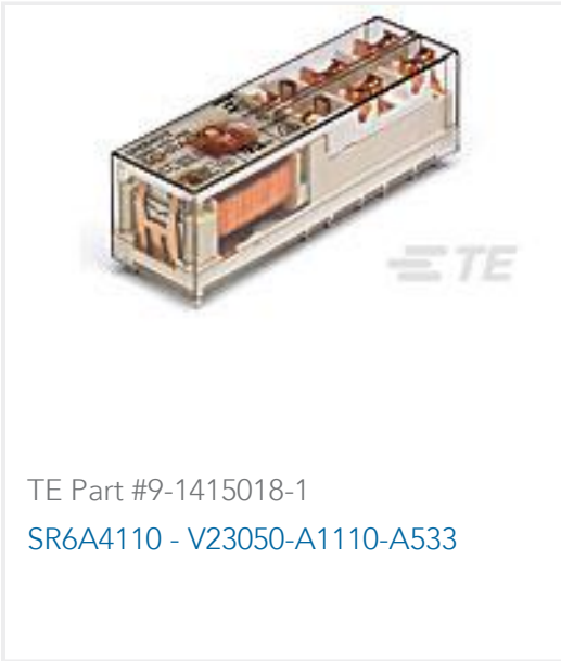
TE Part #9-1415018-1 SR6A4110 - V23050-A1110-A533