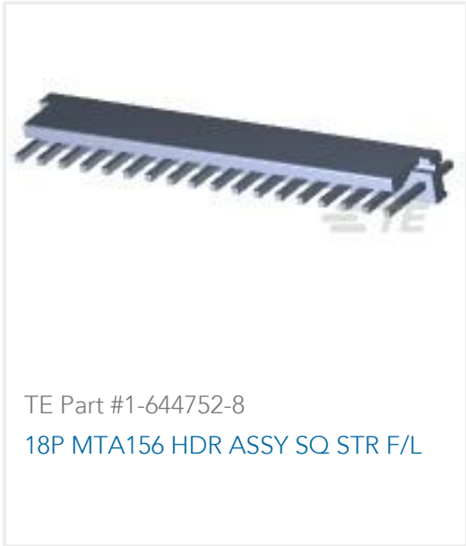
TE Part #1-644752-8 18P MTA156 HDR ASSY SQ STR F/L