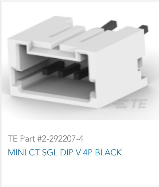
TE Part #2-292207-4 MINI CT SGL DIP V 4P BLACK