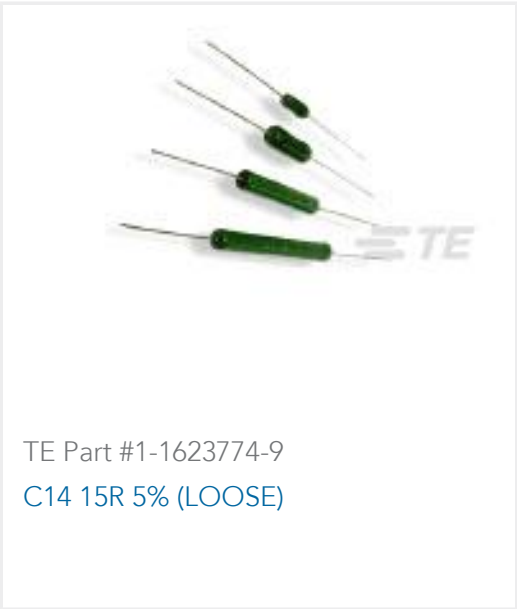
TE Part #1-1623774-9 C14 15R 5% (LOOSE)