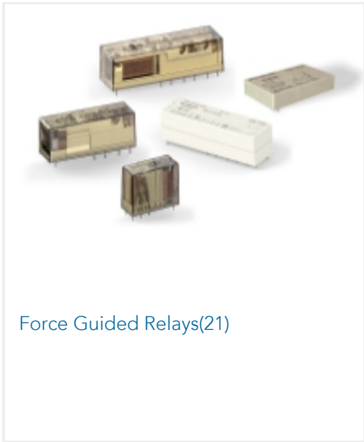
Force Guided Relays(21)