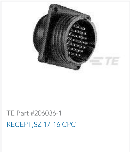
TE Part #206036-1 RECEPT,SZ 17-16 CPC