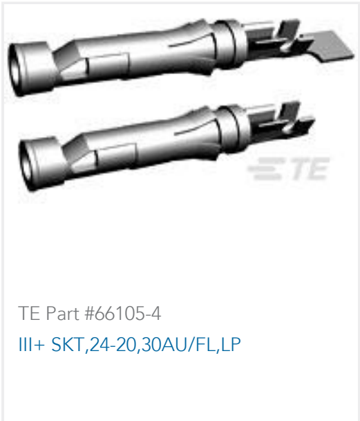
TE Part #66105-4 III+ SKT,24-20,30AU/FL,LP