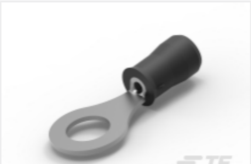
TE Part #CAT-P592-R472A PIDG Ring Tongue Terminals