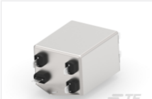
TE Part #1-1609965-2 KEB 6A 1S SPADE DELTA 440VAC