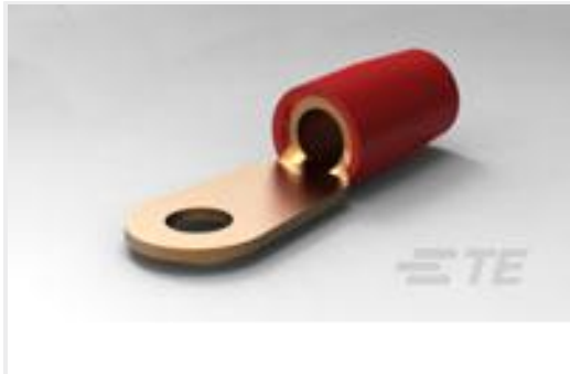
TE Part #324043 TERMINAL,T-N R 8 10