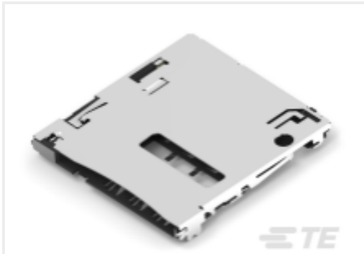
TE Part #2822541-1 PUSH-PUSH MICRO SIM CONNECTOR