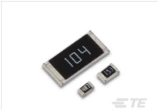
TE Part #3-2176339-4 CRGCQ 0603 5K6 1%