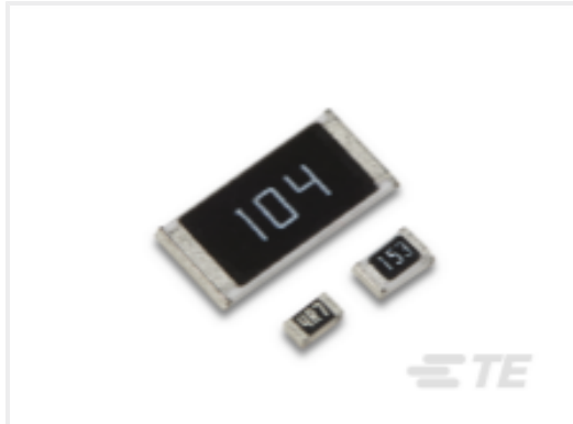
TE Part #2-2176339-1 CRGCQ 0603 470R 1%