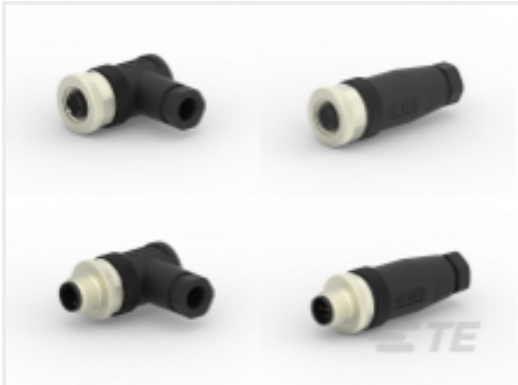
TE Part #CAT-C73765-M1E M12 Field Installable Unshielded