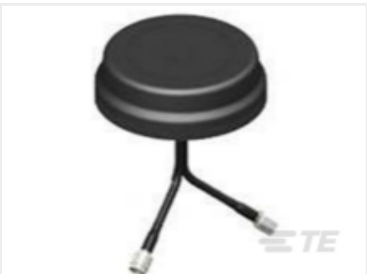
TE Part #VMD24493RSM-366 MIMO,802.11,X2,12FT,RSMA