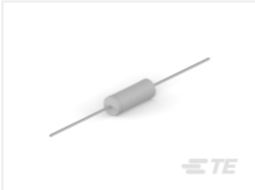
TE Part #9-2176412-3 5W XSM M/OX 5% 36K