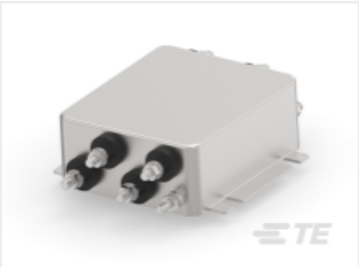
TE Part #3-1609966-8 KES 40A 1S NUT WYE 440VAC