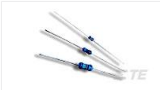
TE Part #1622796-3 YR1 0.1% 102K