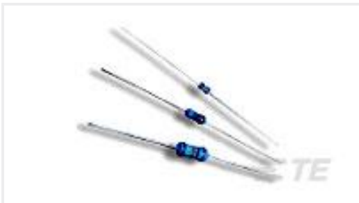
TE Part #1879027-1 YR1 0.1% 523K