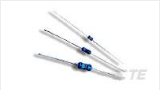
TE Part #1-1676914-1 YR1 0.1% 392K