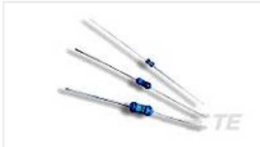
TE Part #6-1622796-3 YR1 0.1% 154K