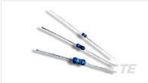
TE Part #1-1676913-6 YR1 0.1% 1K58