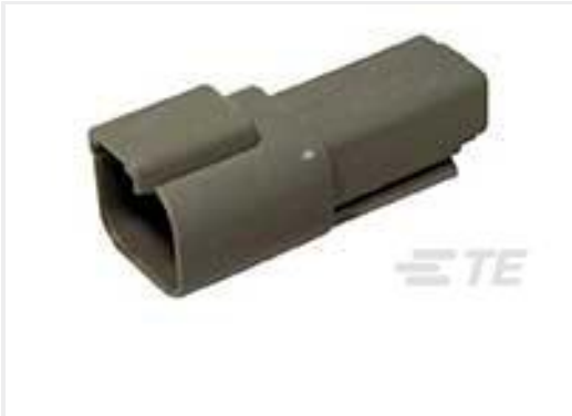
TE Part #DT04-2P REC, 2P, GRY, N