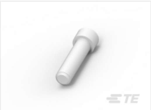
TE Part #114017-ZZ SEALING PLUG, SIZE 12/16, WHT