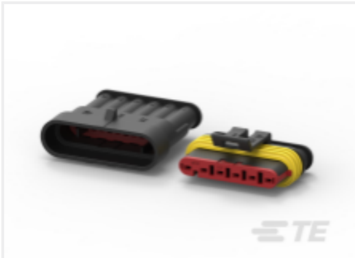
TE Part #CAT-AM71-CH8172 AMP SUPERSEAL 1.5MM, CONNECTOR HOUSING