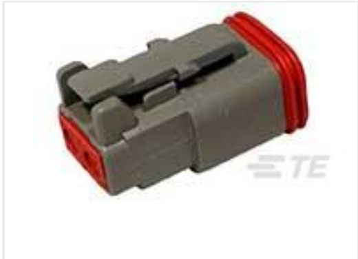
TE Part #DT06-2S PLG, 2P, GRY, N