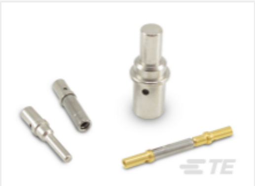
TE Part #CAT-D48-ST273 DEUTSCH Solid Contacts