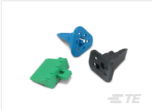
TE Part #CAT-D487-W416 Wedgelocks: DEUTSCH DT