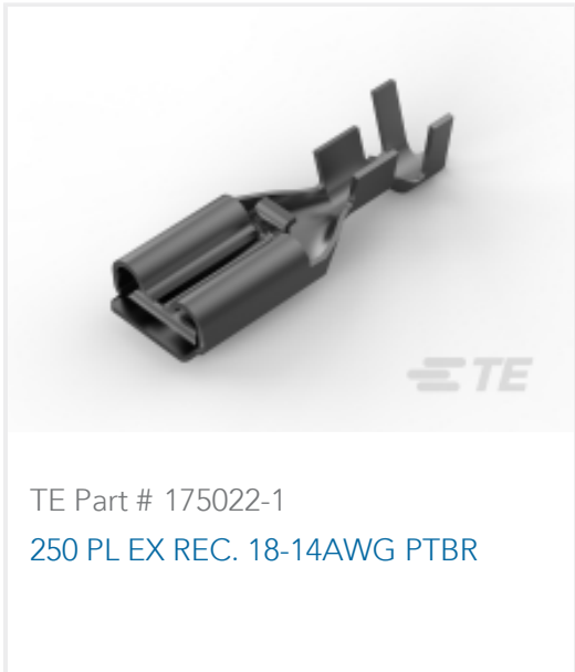
TE Part # 175022-1 250 PL EX REC. 18-14AWG PTBR