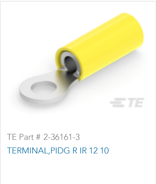
TE Part # 2-36161-3 TERMINAL,PIDG R IR 12 10