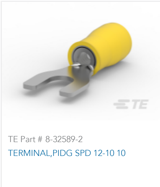
TE Part # 8-32589-2 TERMINAL,PIDG SPD 12-10 10