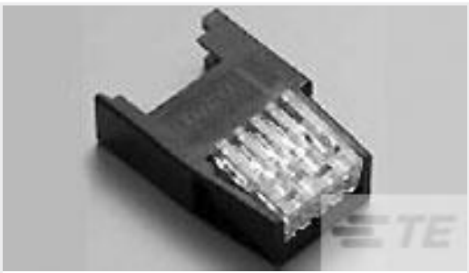
TE Part #1746741-3 RITS CONN. SOCKET ASSY 3P YELLOW