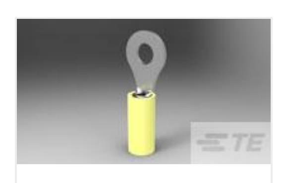
TE Part #323915 TERMINAL,PIDG R 26-22 6