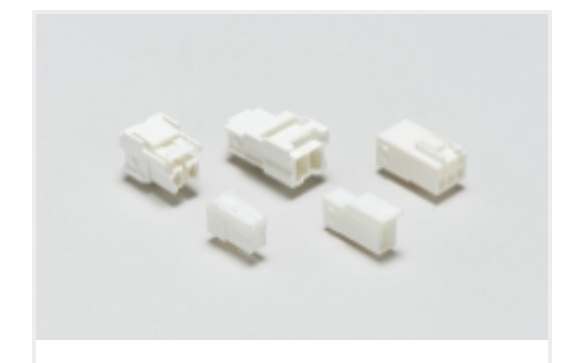
Rectangular Power Connectors(1)