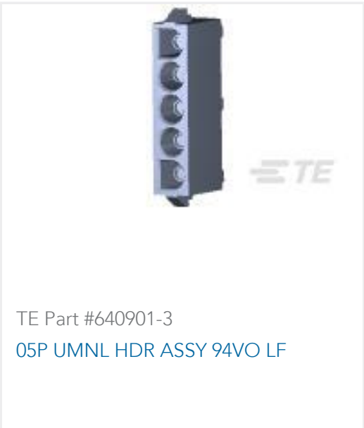
TE Part #640901-3 05P UMNL HDR ASSY 94VO LF