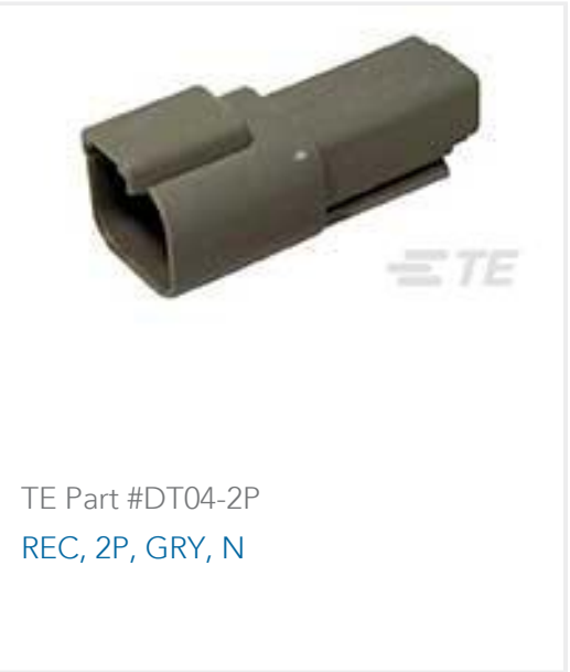
TE Part #DT04-2P REC, 2P, GRY, N