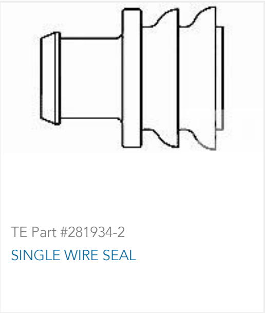
TE Part #281934-2 SINGLE WIRE SEAL