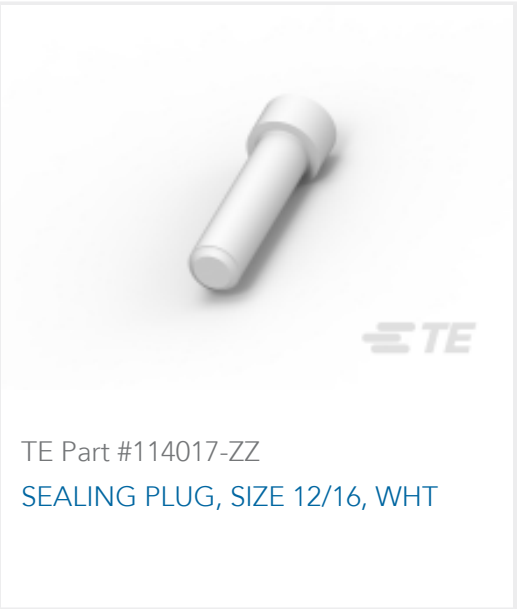
TE Part #114017-ZZ SEALING PLUG, SIZE 12/16, WHT