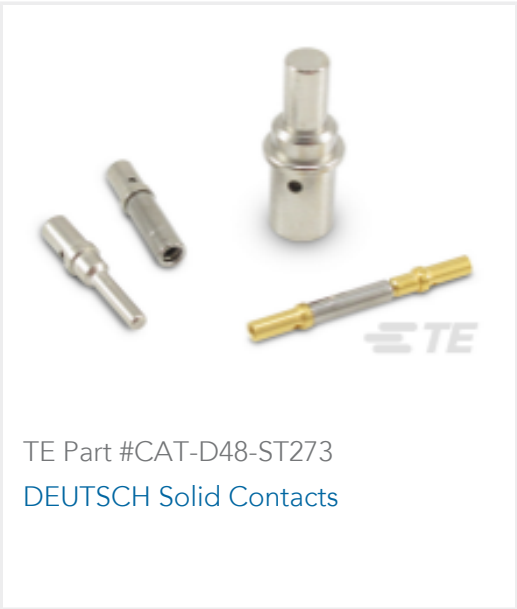
TE Part #CAT-D48-ST273 DEUTSCH Solid Contacts