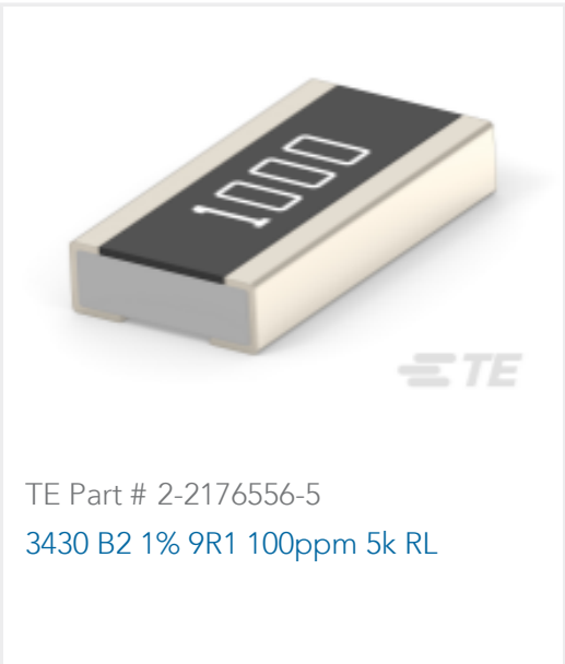
TE Part # 2-2176556-5 3430 B2 1% 9R1 100ppm 5k RL