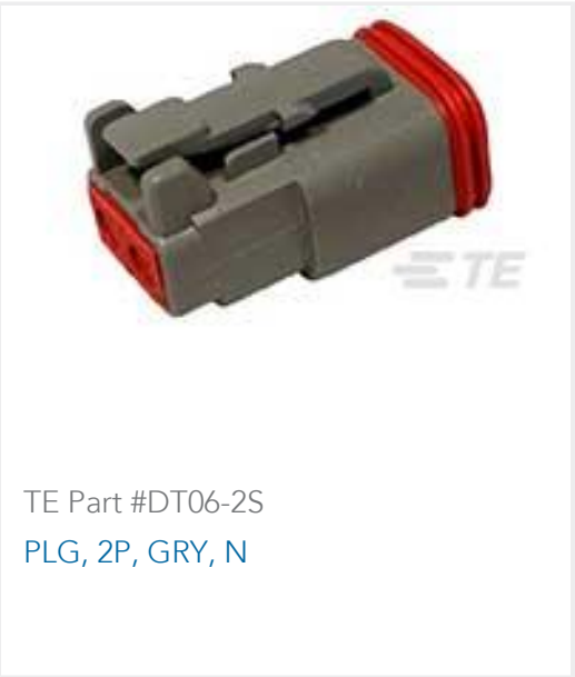
TE Part #DT06-2S PLG, 2P, GRY, N