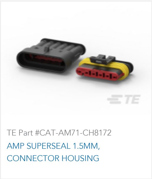
TE Part #CAT-AM71-CH8172 AMP SUPERSEAL 1.5MM, CONNECTOR HOUSING