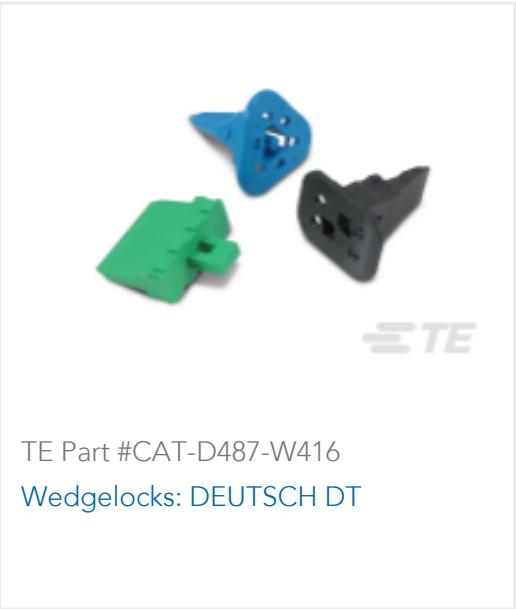
TE Part #CAT-D487-W416 Wedgelocks: DEUTSCH DT