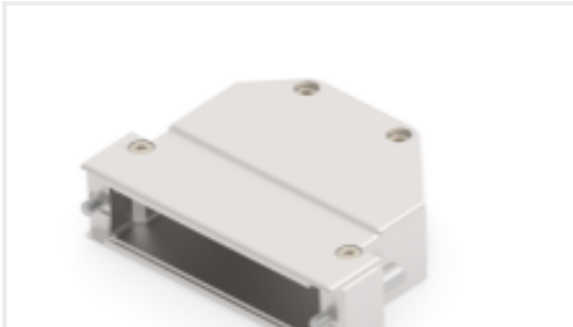
TE Part #1-2308346-3 FULL METAL HOODS SIZE 5 - 3 (RAW)