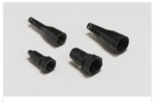
Connector Strain Relief(67)