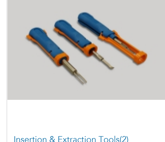
Insertion & Extraction Tools(2)