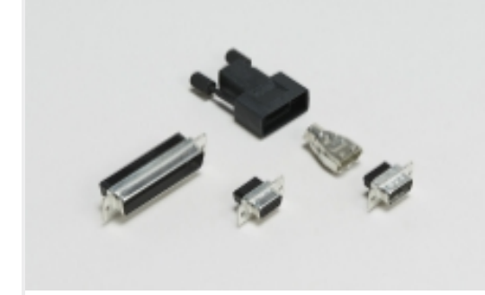
Crimp D-Sub Connectors(10)