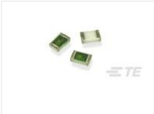
TE Part #1676168-2 RN 0805 124K 0.1% 10PPM 1KRL