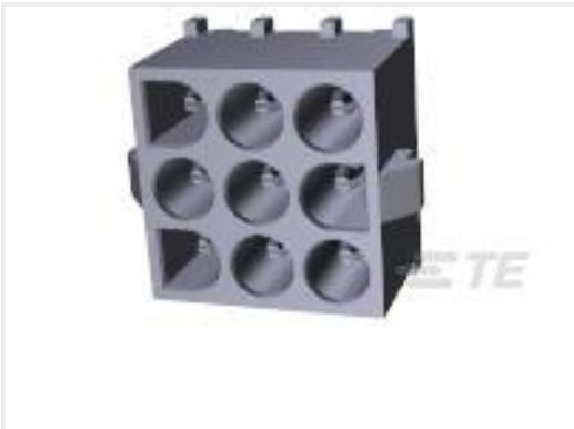
TE Part #350742-1 09P UMNL PIN HDR ASSY 94VO