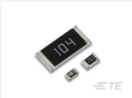
TE Part #2-2176345-3 CRGCQ 1210 680R 1%