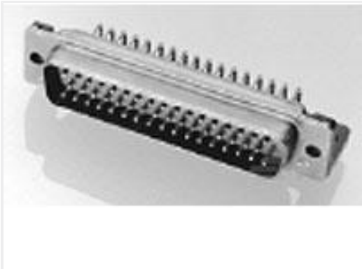
TE Part #1218408-3 AMPLIMITE,ASY,RCPT,RTANG,109,3