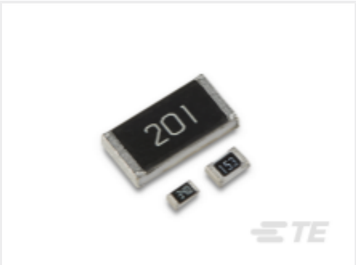
TE Part #3-2176330-5 CRGP 2010 6K8 1%