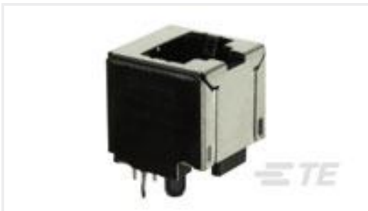
TE Part #6116202-1 MJ,TE,8P,COMPL.PIN,CAT5,PC