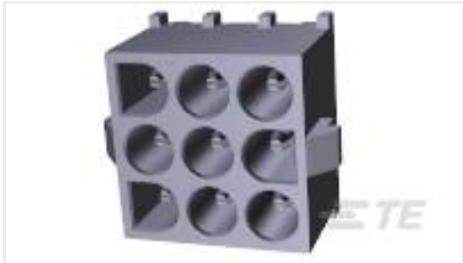
TE Part #350742-1 09P UMNL PIN HDR ASSY 94VO