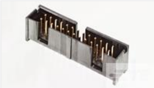
TE Part #2-1761603-7 IDC LOW PRO HDR 20P VERT BLUE