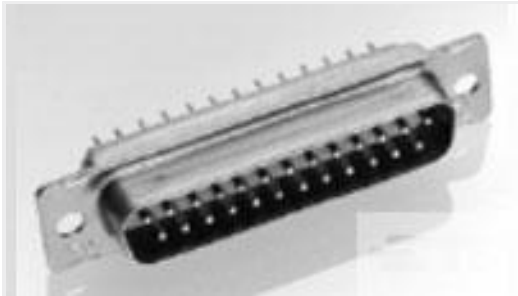
TE Part #1757824-7 AMPLIMITE,ASY,RCPT,STD,90,ZN,1,CT