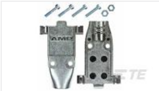
TE Part #5745171-5 AMPL CBL CLMP KIT SZ 1