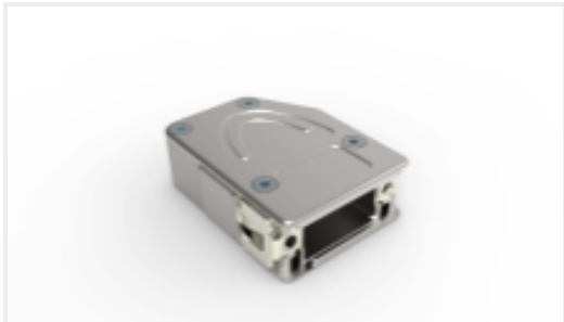
TE Part #1-2308319-1 FULL METAL HOODS SIZE 1 (1)