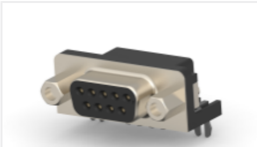
TE Part #2311765-1 AMPL REC, HD20, R/A, 9P, S/L, .318