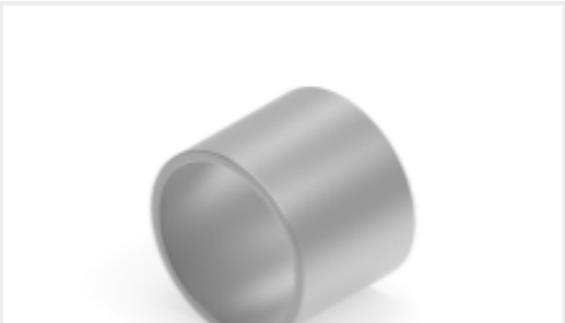
TE Part #1-2308350-7 CRIMP BARREL7