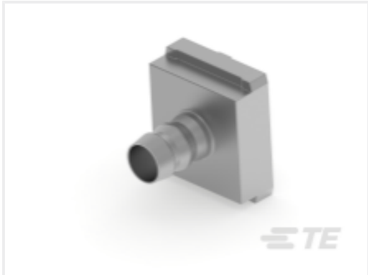
TE Part #2-2308349-2 CRIMP FLANGE 12 SMALL