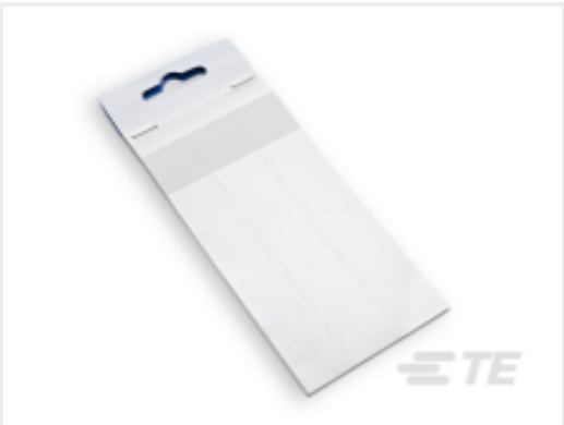
TE Part #8-1768048-1 TKM75-N