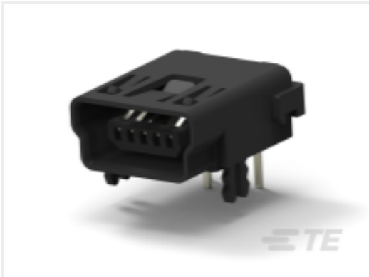
TE Part #1734510-1 MINI USB, TYPE B, R/A, T/H