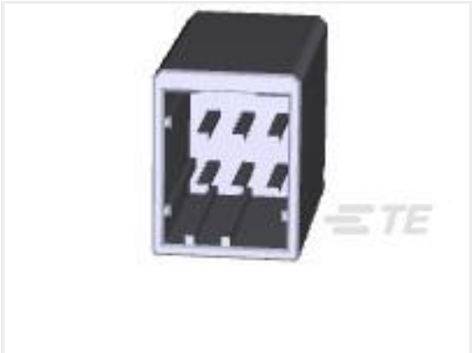
TE Part #1318124-2 DYNAMIC D2100 HDR V ASSY 6P Y