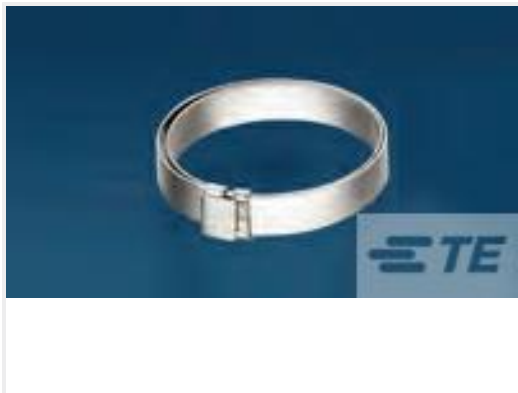
TE Part #CW2823-000 R85049/128-3