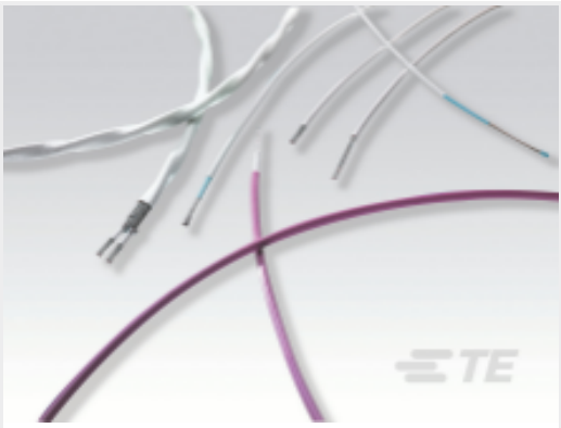
TE Part #CAT-55A-TC-H20 General Purpose Hookup Wire: Tin Coated Copper Wire, 20 AWG