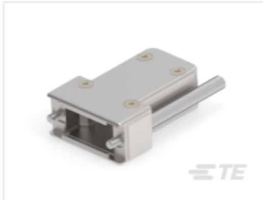
TE Part #1-2308340-5 FULL METAL HOODS SIZE 1-5 (RAW 180 DEG)