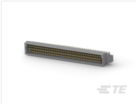
TE Part #650473-5 096 EURO TYPE C PIN ST ASSY