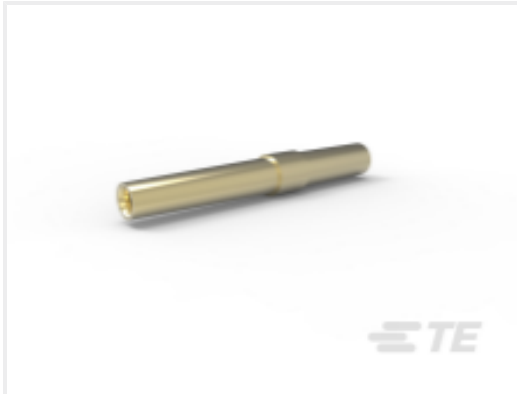
TE Part #2334108-3 SOCKET CRIMP CONTACT AWG 22-24