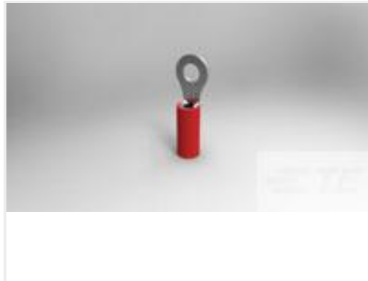
TE Part #130046 PIDG RING TONGUE