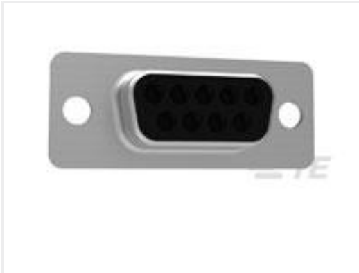
TE Part #5-747905-2 9 Rcpt Solder Cup, Gold Flash,