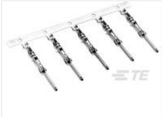
TE Part #66098-6 III+ PIN,18-16,30AU>10,STRIP