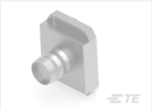
TE Part #1-2308348-7 CRIMP FLANGE 7 LARGE