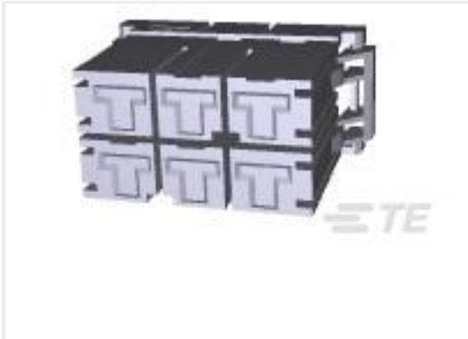
TE Part #3-917807-3 DYNAMIC D-5200M REC HSG 6P X-Y