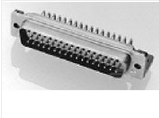
TE Part #1218408-3 AMPLIMITE,ASY,RCPT,RTANG,109,3