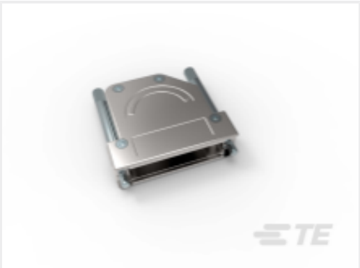
TE Part #1-2308342-6 FULL METAL HOODS SIZE 3-6 (RAW)