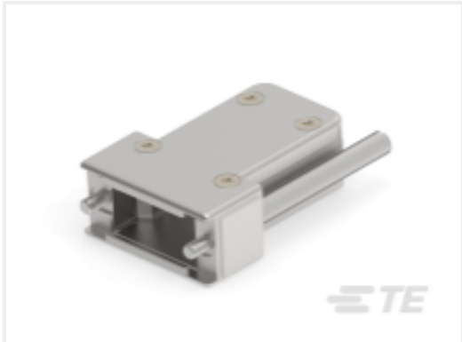
TE Part #1-2308340-6 FULL METAL HOODS SIZE 1-6 (RAW 180 DEG)