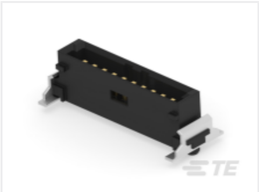
TE Part #294919-E SRCP 1,27 10 M 1 SMD 137 E1 094 * GU-H *