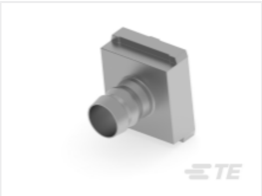
TE Part #2-2308349-0 CRIMP FLANGE 10 SMALL