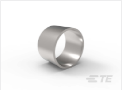
TE Part #CAT-R131-B2745 Crimp Barrel for D-Sub Connectors