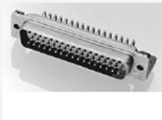
TE Part #1218408-1 AMPLIMITE,ASY,RCPT,RTANG,109,1