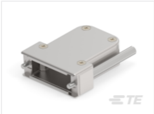
TE Part #1-2308341-6 FULL METAL HOODS SIZE 2-6 (RAW 180 DEG)