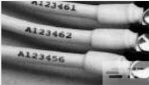
TE Part #5053384013 RNF-100-1-1/2-9-SP