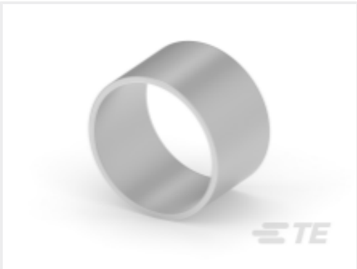
TE Part #2-2308350-2 CRIMP BARREL12