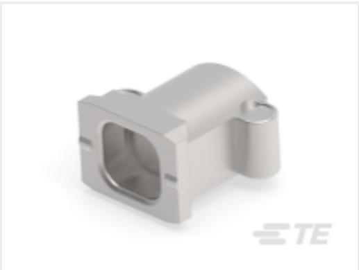
TE Part #1-2308272-6 CABLE CLAMP6 (CASE RAW)