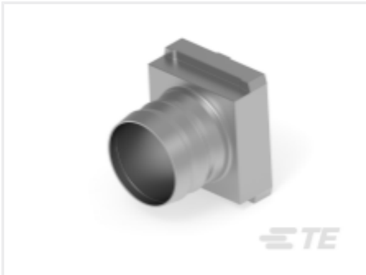
TE Part #1-2308349-1 CRIMP FLANGES SMALL