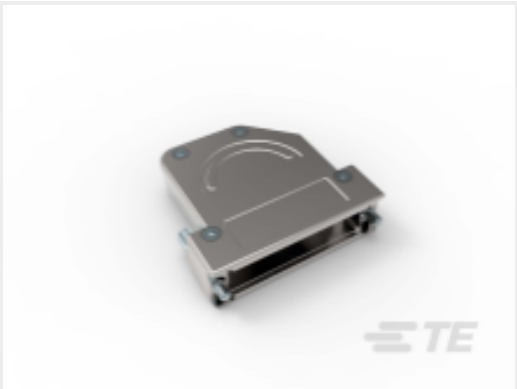
TE Part #1-2308342-4 FULL METAL HOODS SIZE 3-4 (RAW)