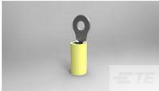
TE Part #54311-1 TERMINAL,PIDG R 26-24 8