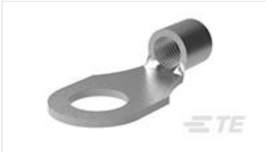
TE Part #321828 TERMINAL,SOLIS R 14-12 10