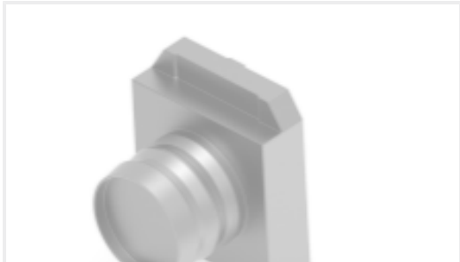
TE Part #2-2308348-3 CRIMP FLANGE 13 LARGE