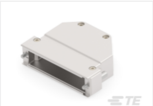
TE Part #1-2308346-3 FULL METAL HOODS SIZE 5 - 3 (RAW)