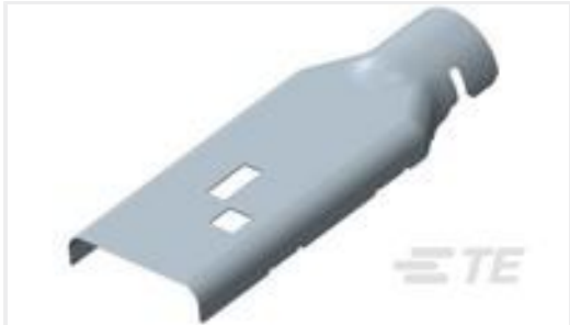
TE Part #2103171-1 SHIELD, CAP, HVA280-2PHM