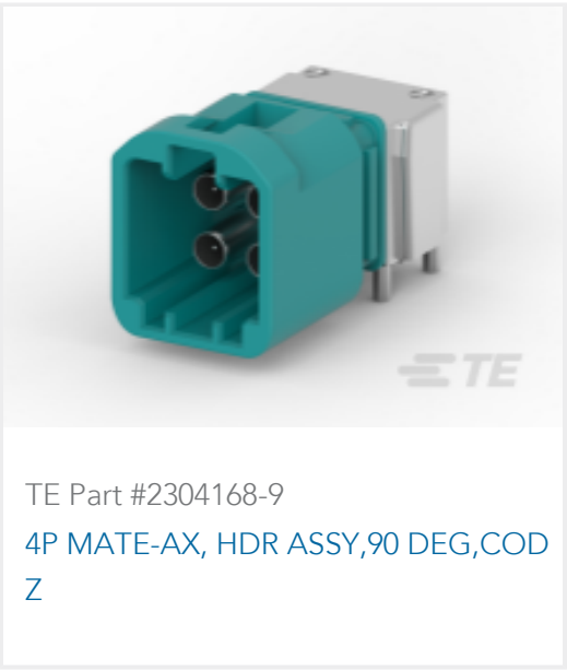
TE Part #2304168-9 4P MATE-AX, HDR ASSY,90 DEG,COD Z