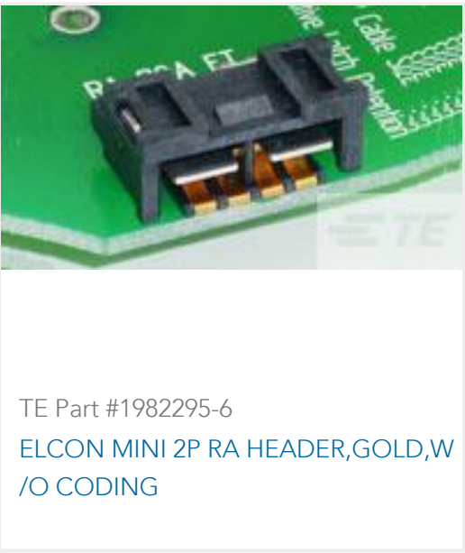
TE Part #1982295-6 ELCON MINI 2P RA HEADER,GOLD,W /O CODING