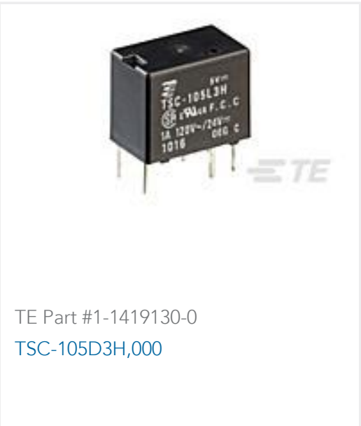
TE Part #1-1419130-0 TSC-105D3H,000

22POS HDR 90 DEG,HT,5.08MM PITCH,TL2.6MM