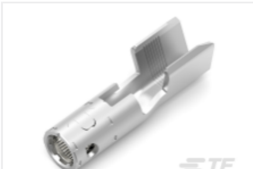
TE Part #2208669-3 8MM HV, CONTACT,ASSY