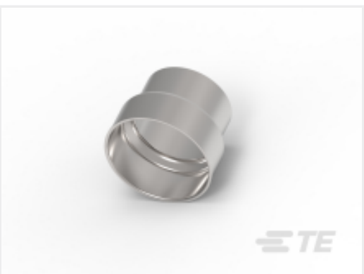
TE Part #2177090-3 STEEL,OUTER FERRULE,8MM HV, 25SQMM