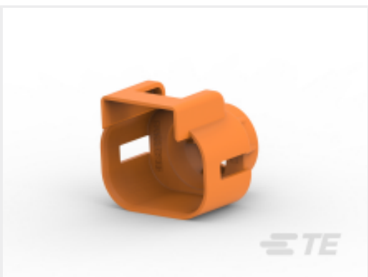
TE Part #2103013-3 CABLE SEAL RETAINER, SIZE 2, OR, HVA280