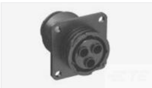
TE Part #788189-2 CPC 17-3 RCPT ASY,REV SEX