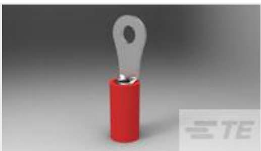
TE Part #2-330648-1 PIDG 22-16 22-18 MIL R 4; TAPE