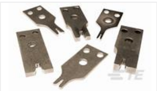
TE Part #1-1633961-2 CRIMPER, INSULATION F PREMIUM