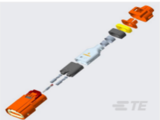
TE Part #YHV280-2PM-P-4MM-B HVA280-2phm,pass,4sqmm,Key B