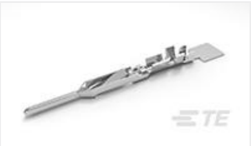
TE Part #86557-6 FFC PIN ROUND WIRE PLATED