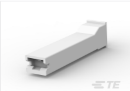
TE Part #2232942-1 110 POS-LK MARK III NAT