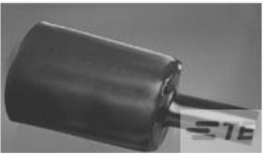
TE Part #CX7208-000 RHW-12/3-1200/ADH-0