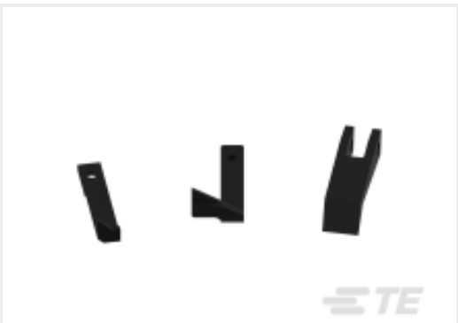
TE Part #1338685-1 FEED PAWL

Product Drawings TERM, RT, PIDG, 12-10, 1/4, T&R English