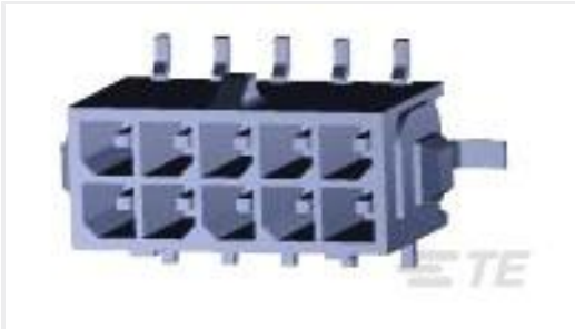
TE Part #4-794637-0 10P MICRO MNL ASSY,VRT,SMT LF