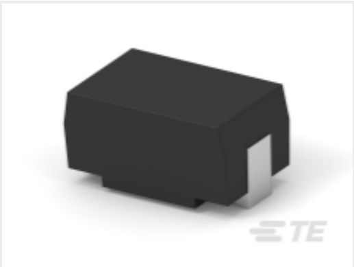
TE Part #CAT-C339-SM1 SMD Power Resistor: 7 Watt, 200-2M Ohm