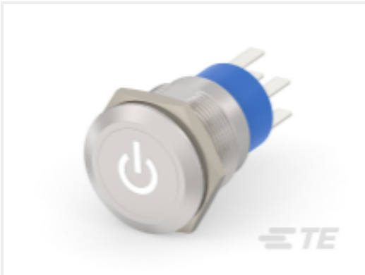
TE Part #6-2213766-3 AV19 DPL 3A POWER LED WHITE 24V