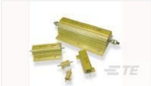
TE Part #1625999-1 HSC100 100R 5%