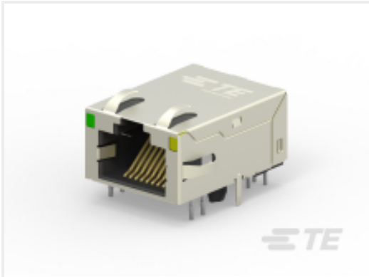
TE Part #6-2301994-1 RJ45 JACK INT.MAG. 1GB LED 1X1 INV (LOW)