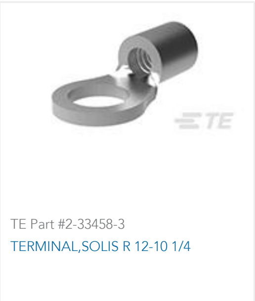
TE Part #2-33458-3 TERMINAL,SOLIS R 12-10 1/4