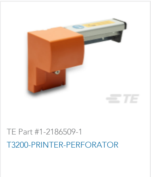
TE Part #1-2186509-1 T3200-PRINTER-PERFORATOR