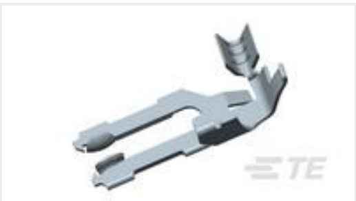
TE Part #926770-1 MT.EDGE CRIMP CONT.