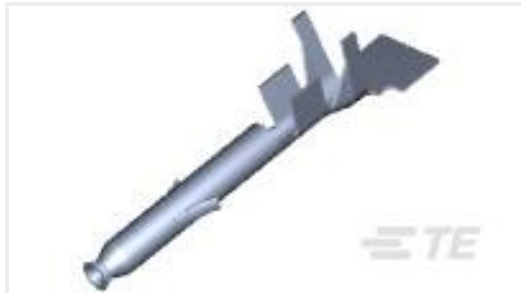
TE Part #770904-6 MINI UMNL SOK CONT 22-18AWG AU