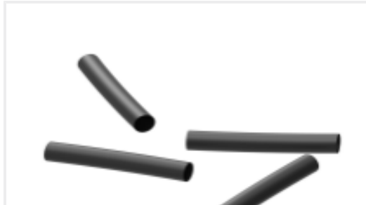
TE Part #EK5194-000 ES2000-NO.6-H2-0-39MM