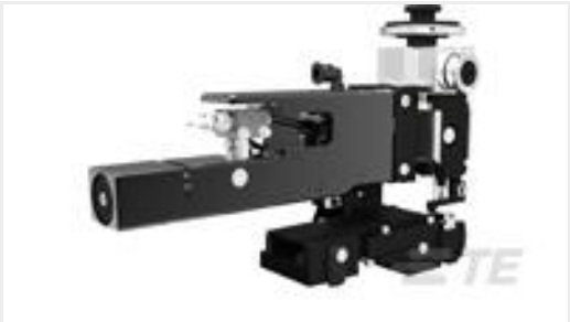
TE Part #2151032-2 OCEAN_2.0_APPLICATOR-S-205D-SSA