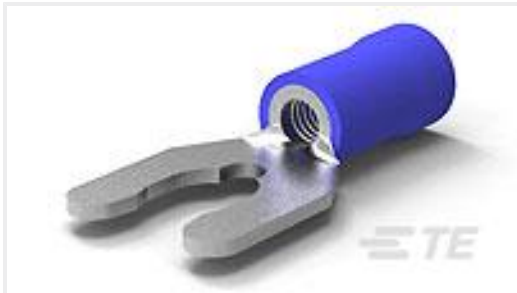
TE Part #52957-1 TERMINAL,PG SPR SPD 16-14 10