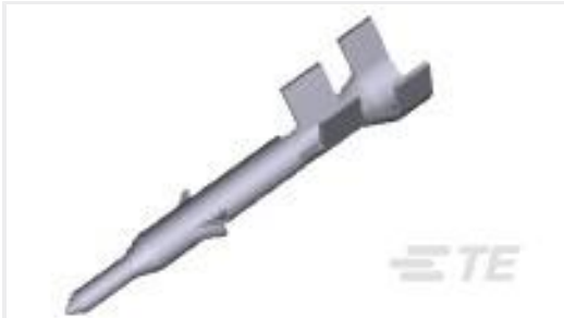
TE Part #794406-3 MINI UMNL CONT 20-16AWG AU