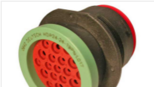
TE Part #HDP24-24-19PN-L017 REC, 19P, BLK, N, RNG, 12/16, P