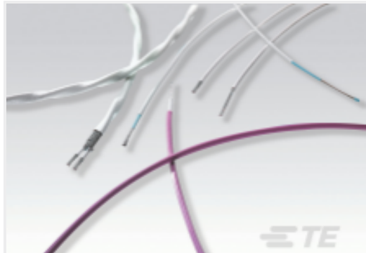
TE Part #CAT-AS22759-32 SAE AS22759: 32/33/44/45/46 - Single- Wall, Lightweight Wire