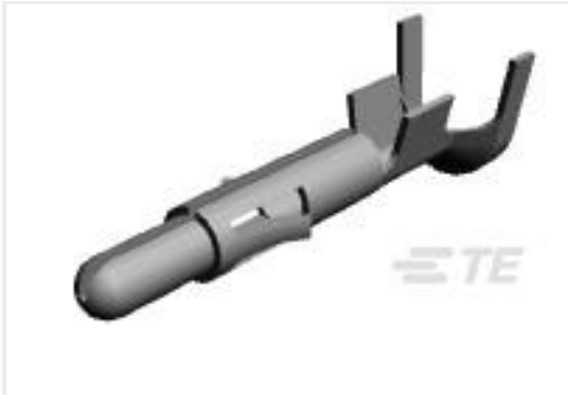
TE Part #350552-6 UMNL PIN 20-14 AU/PHBZ L/P