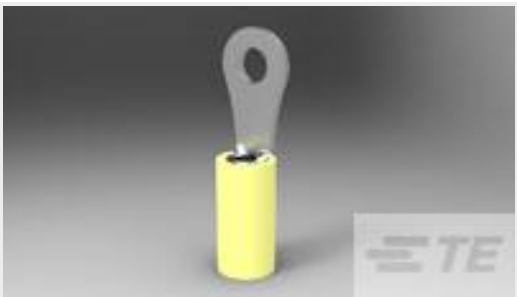
TE Part #1-35148-1 TERMINAL,PIDG R 12-10 4