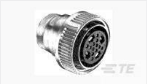
TE Part #208478-1 CMC PLUG ASSEMBLY,SZ 28