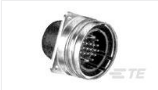
TE Part #208481-1 CMC RECPT ASSEMBLY SIZE 28