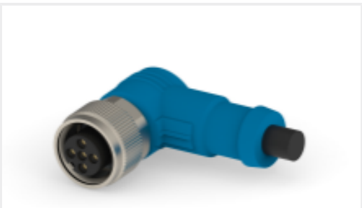
TE Part #T4161410005-002 RPC-M12-FR-5CON-PVC-1.0SH