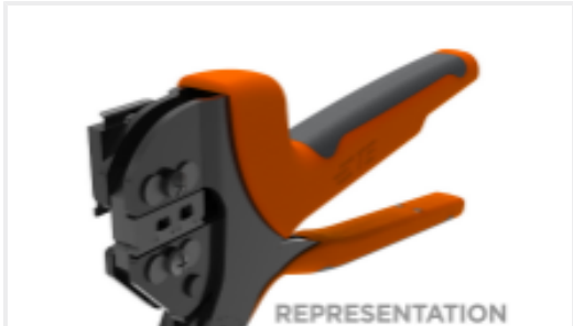
TE Part #2372208-1 SDE HDT-1561-NG DEUTSCH 16-20AWG ASSY