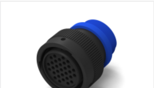
TE Part #HDP26-24-31SE-L015 PLG, 31P, BLK, E, THD, 16, S