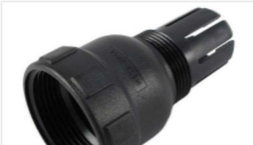
TE Part #M902-2244 BKSHL, 24SZ, CBL SZ .570-710, HDP L015