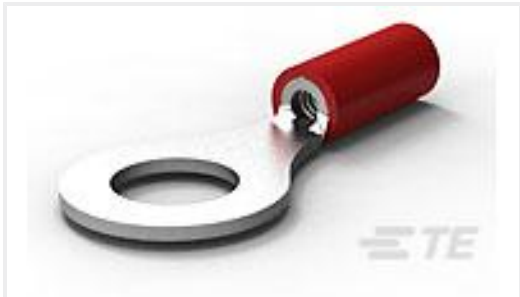
TE Part #32953 PG R 22-16 COMM 22-18 MIL 1/4