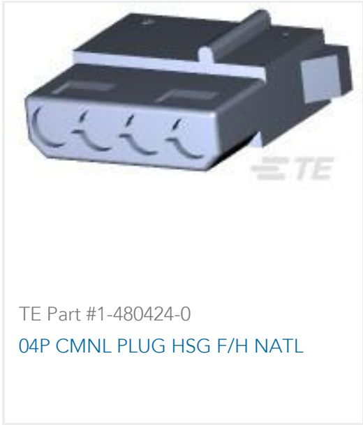
TE Part #1-480424-0 04P CMNL PLUG HSG F/H NATL