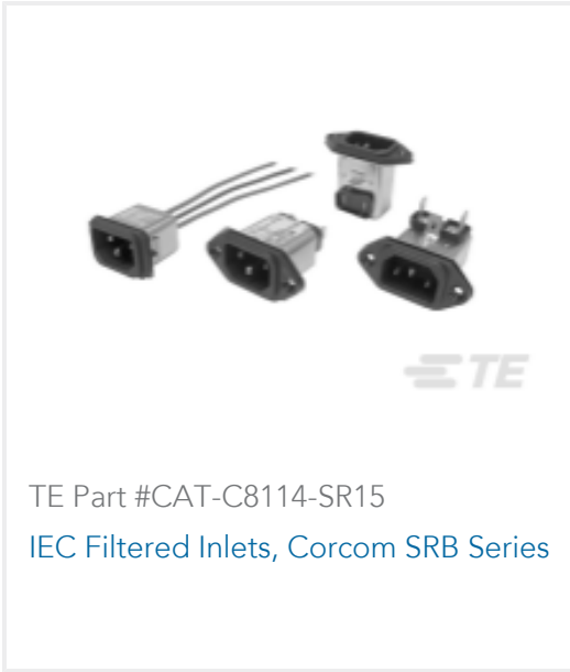
TE Part #CAT-C8114-SR15 IEC Filtered Inlets, Corcom SRB Series