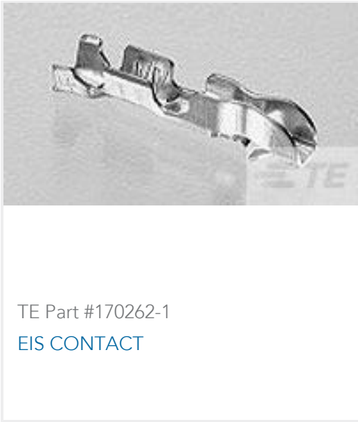
TE Part #170262-1 EIS CONTACT