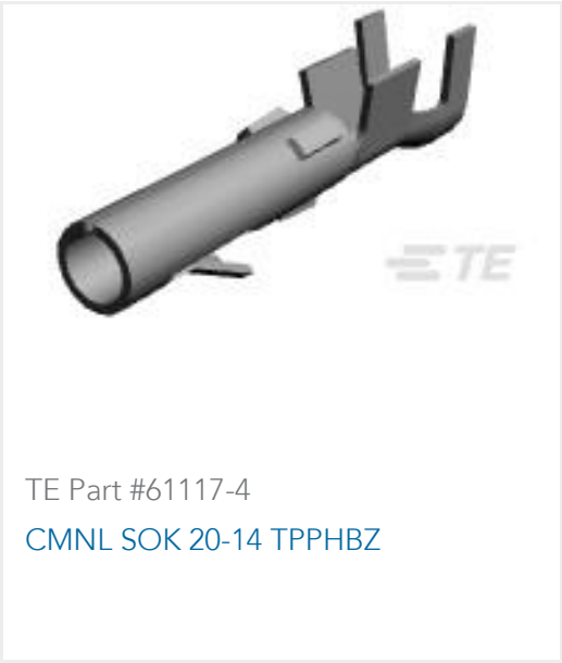
TE Part #61117-4 CMNL SOK 20-14 TPPHBZ