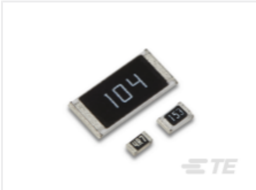
TE Part #4-2176343-7 CRGCQ 1206 68K 1%