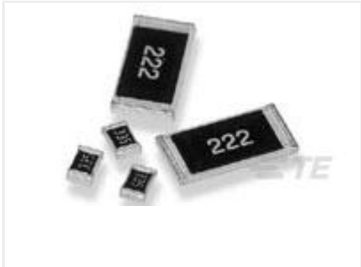
TE Part #1623518-1 CRG1206 1% 47K