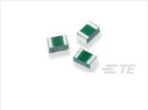
TE Part #1624349-1 NTC0805 5% 1K0