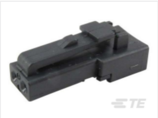
TE Part #DTMN06-2S PLG, 2P, BLK, N, NON-ENVIR