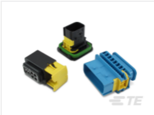
TE Part #CAT-H3399-CH8172 Heavy Duty Sealed Connector Series Housings