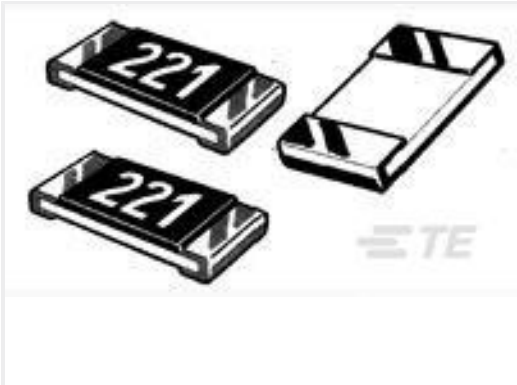
TE Part #3-2176070-1 3521 180R 1% 2W