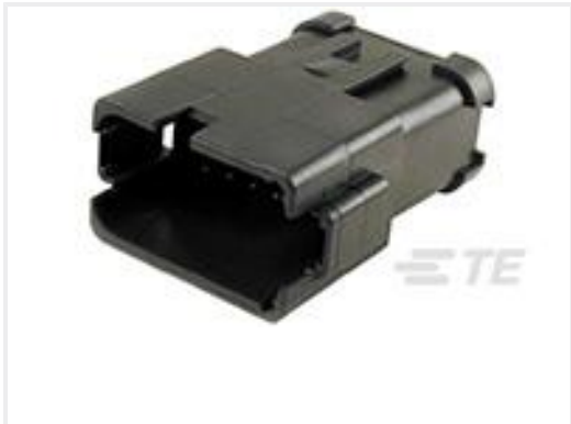
TE Part #DT04-12PB-P030 REC, 12P, BLK, BUSBAR 4X3, NICKEL, B