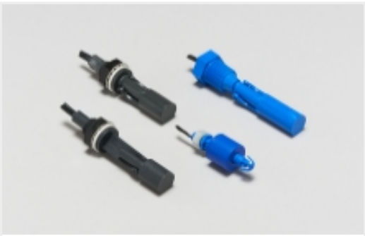
Liquid Level Switches(10)