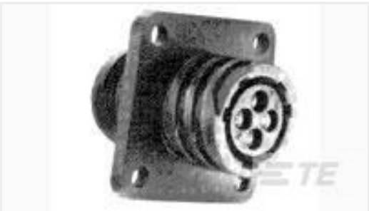
TE Part #206430-3 CPC RECPT ASSEMBLY SIZE 11-4