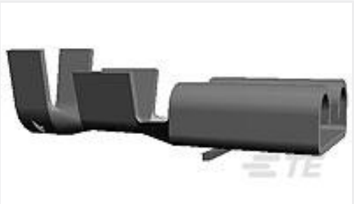
TE Part #42904-2 FF 250 REC TERMINAL 16-12 AWG TPBR