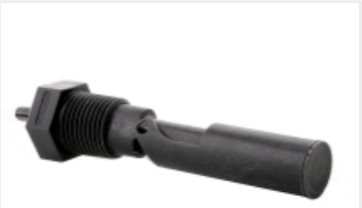
TE Part #80649-000 LS809-32 LIQUID LEVEL SENSOR