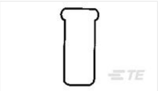
TE Part #328307 SPARE WIRE CAP,RED 22-18 AWG