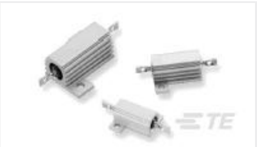
TE Part #1879073-4 THS10 R18 5%