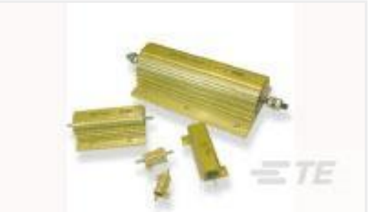
TE Part #9-1625984-4 HSA50 R18 5%