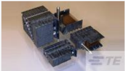
TE Part # 2007820-2 IMP100S,H,V4P10C,UG,OEW39,4.9

This information is provided based on reasonable inquiry of our suppliers and represents our current actual knowledge based on the information they provided. This information is subject to change. The part numbers that TE has identified as EU RoHS compliant have a maximum concentration of 0.1% by weight in homogenous materials for lead, hexavalent chromium, mercury, PBB, PBDE, DBP, BBP, DEHP, DIBP, and 0.01% for cadmium, or qualify for an exemption to these limits as defined in the Annexes of Directive 2011/65/EU (RoHS2). Finished electrical and electronic equipment products will be CE marked as required by Directive 2011/65/EU. Components may not be CE marked. Additionally, the part numbers that TE has identified as EU ELV compliant have a maximum concentration of 0.1% by weight in homogenous materials for lead, hexavalent chromium, and mercury, and 0.01% for cadmium, or qualify for an exemption to these limits as defined in the Annexes of Directive 2000/53/EC (ELV). Regarding the REACH Regulation, the information TE provides on SVHC in articles for this part number is based on the latest European Chemicals Agency (ECHA) 'Guidance on requirements for substances in articles' posted at this URL: https://echa.europa.eu/guidance-documents/guidance-on-reach