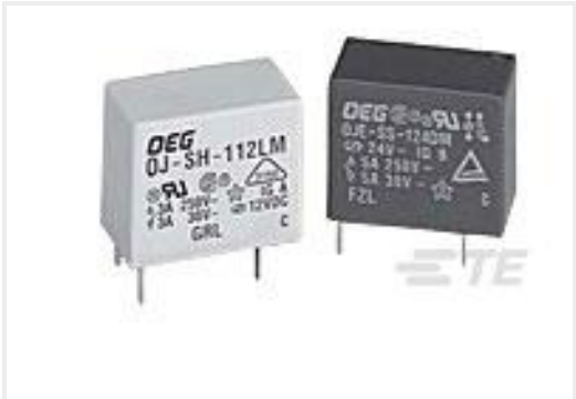
TE Part #1461247-3 OJ-SH-124LMH,000