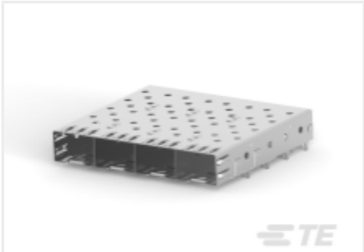
TE Part #1658744-3 SFP 1X4 CAGE ASSY