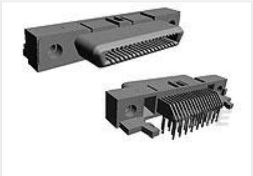
TE Part #5796055-1 68 CHAMP R/A ASSY,LC