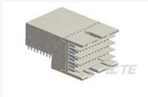
TE Part #2042139-2 RA Male Connector, IEC L3