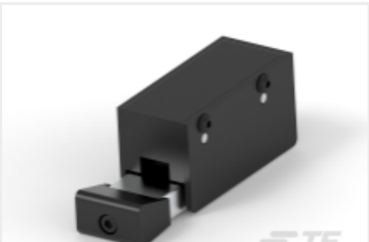
TE Part #2185223-1 ASSY, SEATING TOOL, QSFP