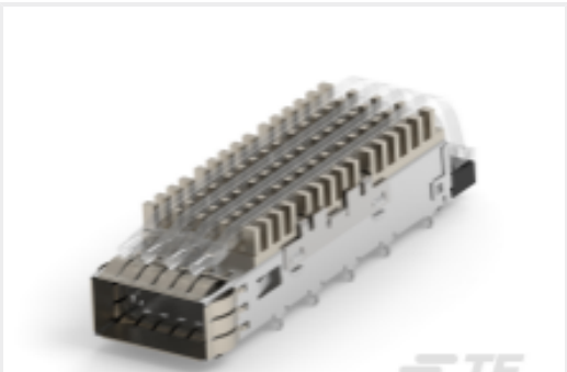
TE Part #5-2170705-8 CAGE ASSY, QSFP28 1X1, SPRING, HS, C LP