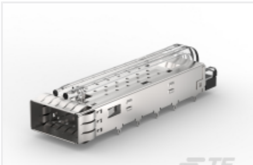
TE Part #1888971-4 QSFP TB CAGE ASSY, W/LP, NO HS