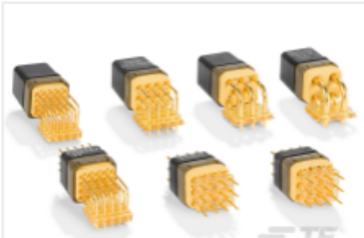
TE Part #ZPF000000000167184 732-8311-16