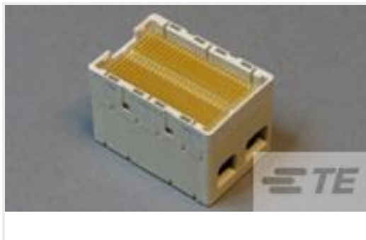
TE Part #7-1761614-5 STEP-Z PLUG 25MM 200P LF ST