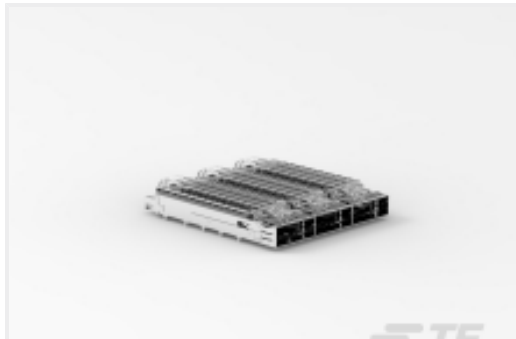
TE Part #2-2170740-1 QSFP28, 1X3, CAGE ASSY, SPRING, HS, LP