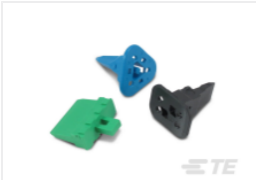
TE Part #CAT-D487-W416 Wedgelocks: DEUTSCH DT