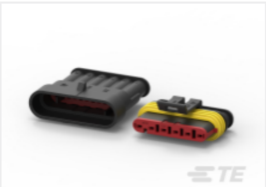
TE Part #CAT-AM71-CH8172 AMP SUPERSEAL 1.5MM, CONNECTOR HOUSING