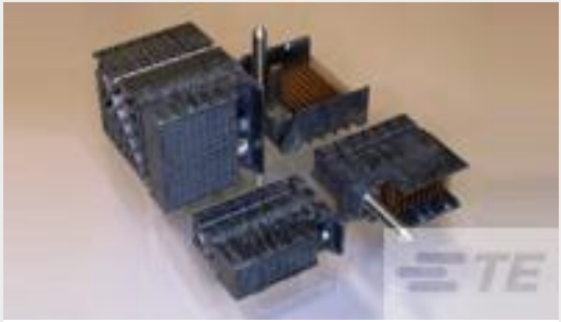
TE Part # 2007705-1 IMP100S,R,RA3P10C,UG,39