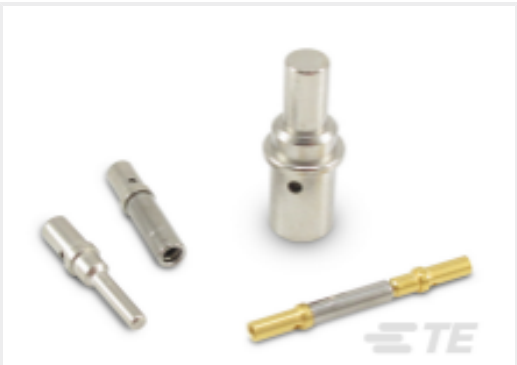
TE Part #CAT-D48-ST273 DEUTSCH Solid Contacts